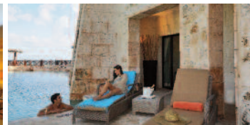
Castle Junior Suite Swim Out